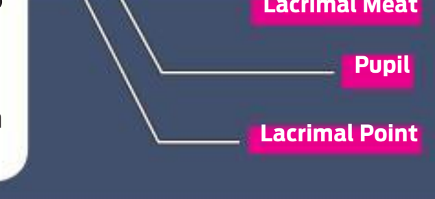
Anatomy of the Human Eye

if the optic nerve is affected and finally the vision will be like looking through a tube. "If that too is not controlled, it results in complete vision loss. Since it starts with damaging the peripheral vision, most people don't realize they have a problem," Ronnie adds.