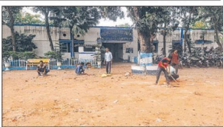
Workers clean up the premises of Kaliaganj police station on Wednesday.

the Bengal secretary, on Wednesday, Mamata said the police should have handled the situation more efficiently. "What were they (police) doing? Why didn't they use batons to disperse the mob? Police have to be more proactive to deal with such situations," the chief minister was quoted to have said at the meeting by an official. She wondered what the intelligence wing had been doing prior to the violence. "It was an announced event (march). Why did the intelligence wing not get the information that the gathering could turn so violent," Mamata said apparently. Talking to journalists later, Mamata asserted that the police would take stringent steps against the perpetrators of the violence. "Government property was vandalised and burnt down yesterday. We will attack the properties of all those who were involved in the attack. This step is necessary to prevent such hoodlumism (in future). The BJP is behind the violence and brought in goons from Bihar," she said. The mob that mostly comprised Rajbanshis and Advashis had organised the march, alleging that the minor girl had been raped and murdered. But the autopsy pointed out poisoning as the possible cause of the death. The agitators turned the CBI to probe the death. "The police are investigating the death of the girl. The autopsy was video-graphed and a doctor concerned said it was a case of suicide. The investigation is on and I must not say anything in advance," said Mamata.