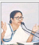
Mamata Banerjee at Nabanna on Wednesday